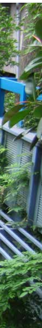
TOP: Derryck-Anderson Brownstone Garden in Harlem, NY, 2008