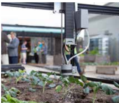
A farming robot waters plants in the community garden.

Spearheaded by Cory Gallo, the garden is located adjacent to the EPA-funded MSU raingarden at the landscape architecture complex on Stone Boulevard. It includes eight accessible planters and 19 large raised planters, two farming robots, and two rain water cisterns. The garden is a cross-campus collaboration between several academic entities, two administrative units and three student organizations. Student organizations include MSU Student Association, MSU Graduate Student Association and Students for a Sustainable Campus. Academic units include the departments of Landscape Architecture; Plant and Soil